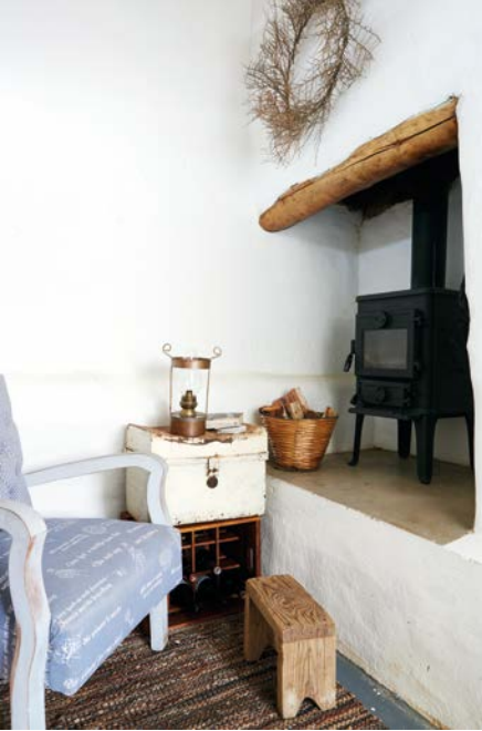
A slow combustion stove was placed in the original fireplace (left). A small white kist, bought for a mere R10 at a local scrapyards, enhances an old-world feel.